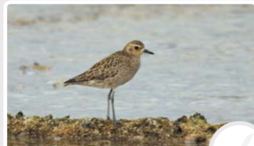
Pacific golden plover